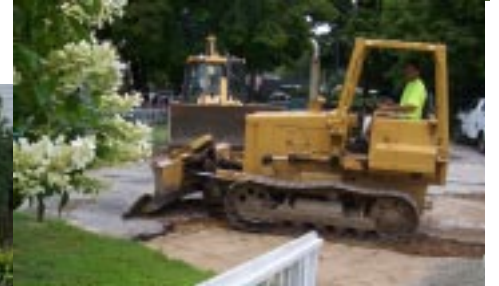
Stevens Excavating Incorporated