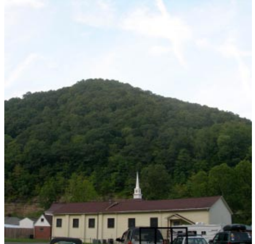
A church in the mountains of Mullens, West Virginia