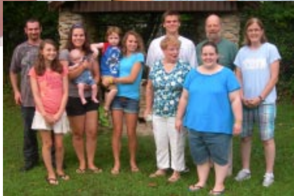
One of our families