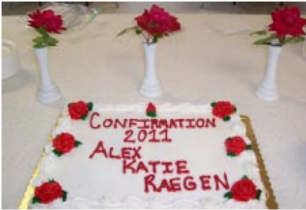
Confirmation Day, June 12, 2011