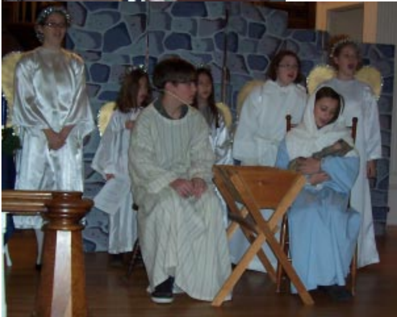
The angel chorus sings to Joseph, Mary and Jesus